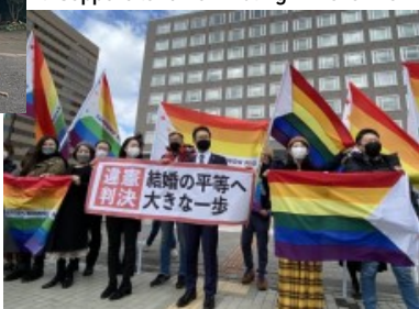
▼ Sapporo landmark ruling in March 2021

Lawsuits began across Japan in 2019 to have the judiciary declare that banning same-sex couples from marrying in Japan is unconstitutional. Not allowing two individuals of the same legal gender to marry infringes on the dignity of the individual and equality, both of which are protected under the constitution, and is a human rights violation. Marriage For All Japan supports the "Freedom of Marriage for All" lawsuits as well as other court cases concerning the legal protection of same-sex couples by sending out information.