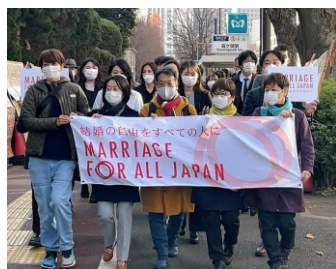
▲ The plaintiffs and the legal team walking into court